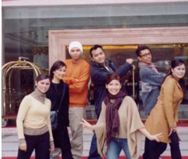
Gambar kenangan di hadapan Hotel penginapan, Nanning China

南宁国际民歌艺术节 Nanning International Folk Song Arts Fes