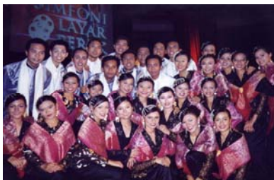
Gambar kenangan 'Simfoni Layar Perak'

Kenangan di Nanning memang menyeronokkan kerana pemergian kami kesana jatuh pada bulan Ramadhan, kami berpuasa dan terbuka dengan nikmatnya. Disamping persembahan yang begitu memberangsangkan.