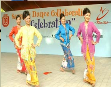
Summer Dance Collaboration Celebration (30 Aug 2003 @ NYC)