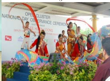
National day event @Jurong Island (13 Aug 2003)