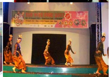
Fun with Food @ Downtown East—Marque (17 Aug 2003)

SRI WARISAN SOM SAID PERFORMING ARTS LTD