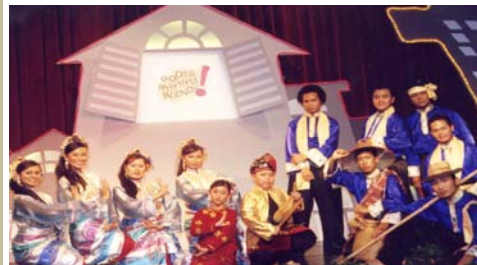
Heritage Festival@Far East Pavillion on 15 April 2003

In conjunction with the Heritage Festival 2003, Sri Warisan was invited to perform at The Singapore River and Far East Pavillion. Colourful music and dance items such as Zapin Warisan , Gotong Royong and Gurindam 12 (poems) by Raja Ali Haji were presented.