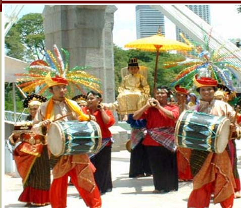
Heritage Festival @Singapore River on 22 April 2003

In conjunction with the Heritage Festival 2003, Sri Warisan was invited to perform at The Singapore River and Far East Pavillion. Colourful music and dance items such as Zapin Warisan , Gotong Royong and Gurindam 12 (poems) by Raja Ali Haji were presented.